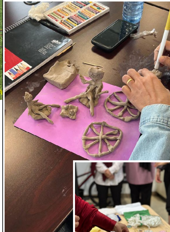
(Top left) Participants mold clay representing symbols of support, energy, and inner peace.

Come along with us to explore the symbols and stories shared on these canvases.