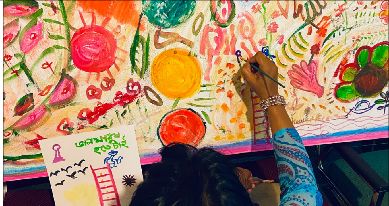
Bengali participant working on a collective painting.