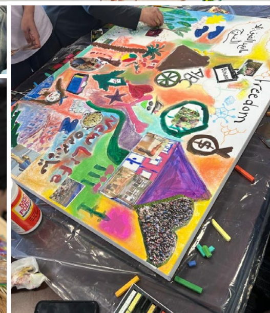
(Bottom right) Participants make art about their journeys to safety.