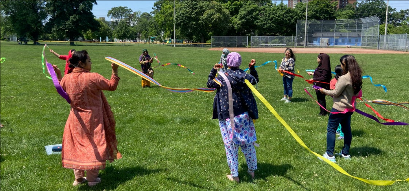
Participants move with dance ribbons at Dentonia Park