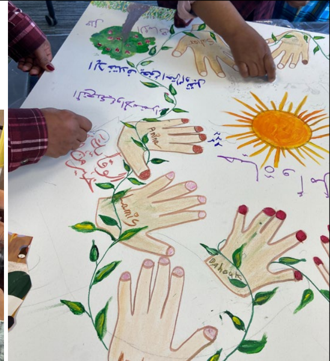
(Top right) Participants trace their hands as part of the final collective painting.