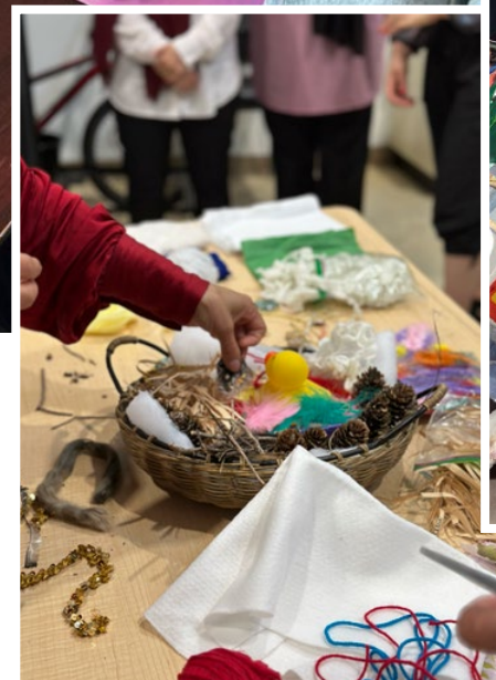
(Bottom left) Participants build a nest together.